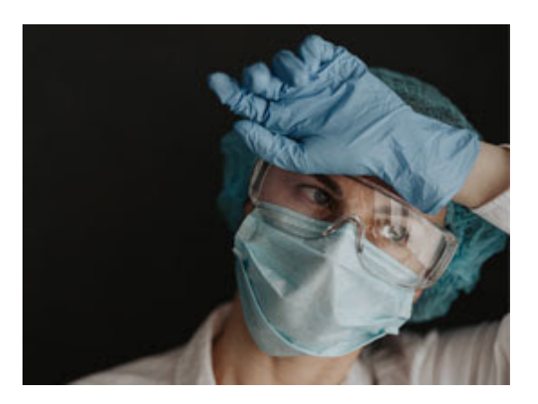
On Feb. 7, Prime Minister Trudeau will meet with provincial leaders to negotiate a deal on health care funding. Sign the petition calling for politicians to put people over profits.

As Unifor recognizes Black History Month, in 2023, our focus is empowering the next generation of Black youth.